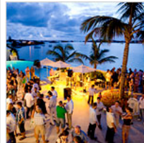
36 Hours in Bermuda