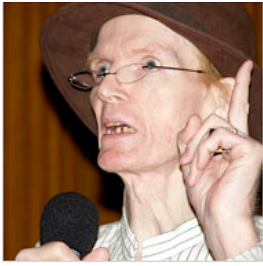
Mr. Carroll at the Brooklyn Book Festival in 2007.

And “he worked irregularly,” she added. “Sometimes it was a struggle to pick up the thread again, but once he did, it would be amazing. He’d have these tremendous flights. He was still very much in the old Romantic school, I guess.”