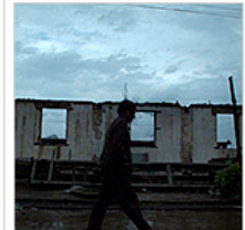
The Serious Regard for Cinema

Home | World | U.S. | N.Y. / Region | Business | Technology | Science | Health | Sports | Opinion | Arts | Style | Travel | Jobs | Real Estate | Automobiles | Back to Top