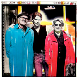
The "Catholic Boy" album cover.