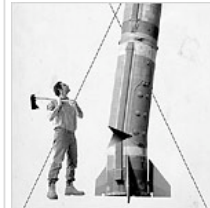
Gorbachev: Two First Steps on Nuclear Weapons