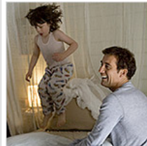
A One-Parent, No-Rules Household