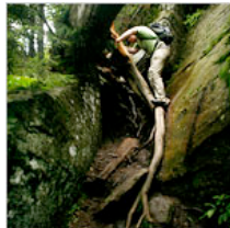
2 Days, 3 Nights, on a Path Named for a Devil